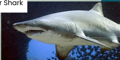
Sand Tiger Shark

Never to be confused with the Tiger Shark, the Sand Tiger Shark is a large, docile species that trolls along the bottom of the ocean in the surf zone. The Sand Tiger is unmistakable, with pointy teeth that protrude out, even when its mouth is closed. It is possible (though not probable) to see a Sand Tiger near the surface from time to time, as they're the only shark known to breach and "gulp air" which helps them to retain more buoyancy in the water.